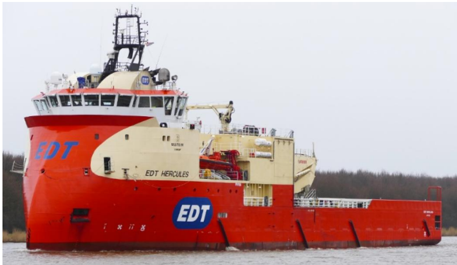
Photo of EDT Hercules

Survey vessel will be EDT Hercules, which will be listening on channel 16 at all times.