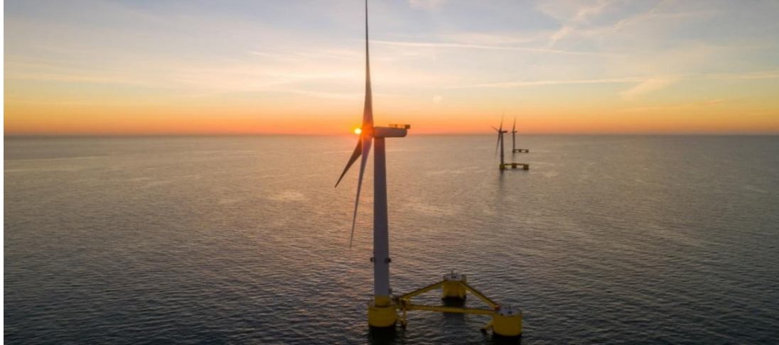
Photo of KIN01, KIN-02 and KIN03